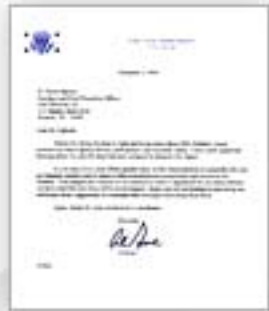
from: AL GORE US Vice President