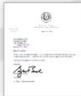
from: GEORGE W. BUSH Texas Governor - US President