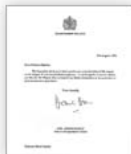
from: BUCKINGHAM PALACE - QUEEN OF ENGLAND