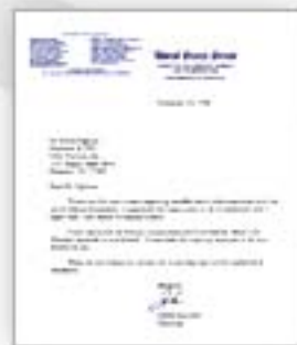
from: JOHN McCAIN US Senator